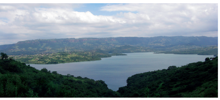
River Basin South Africa.

The approach followed by the teams in the process of developing the different NAPAs is guided by some basic principles, including that the process 'should have a country-driven approach and be a participatory process involving multi-stakeholder consultation, reflecting a true bottom-up approach'. In addition, the process should involve a multidisciplinary group of experts, and undertake comprehensive and integrated assessments and it should