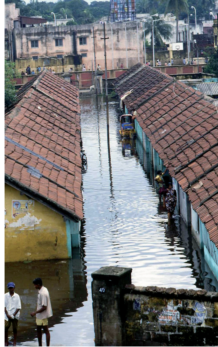
With most of Chennai, India being flat, floods can happen within six minutes from the start of a sustained burst of rain.